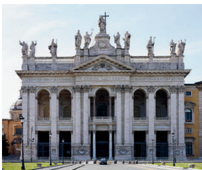
St. John Lateran